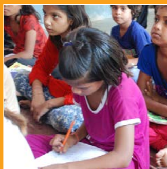
EQU+ (Education Quality Addition Program)