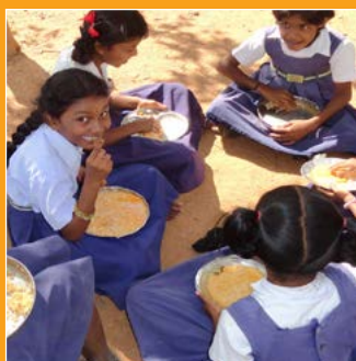
Garden of Peace Nutrition Support