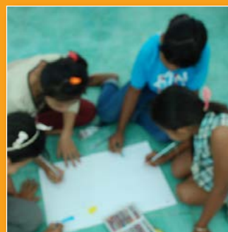
Consoling through Counseling (CTC) & Reintegration Project