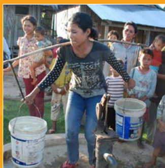
Getting Well Program