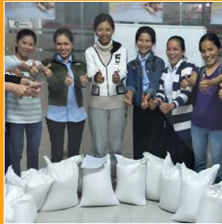
Rice 4 Education