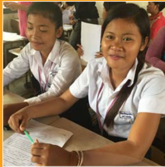
Girls Access to Education